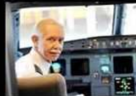
What I think I do.