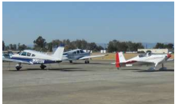
Some of the planes that flew in to the Pancake Breakfast on September 14.