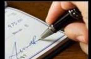
What I actually do.