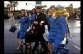
What society thinks I do.