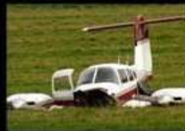
What my instructor thinks I do.